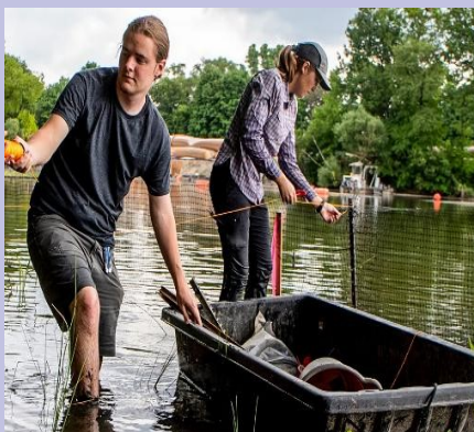
The Nankin Lake Restoration Project by the Wayne County Parks worked to restore the lake's ecosystem with valuable spawning and forage habitat for fish and other aquatic species.

The City of Wyandotte Community Garden was awarded for its continued its development with two wheelchair accessible U-shaped raised beds and four rectangular above ground-beds. This is accessed by a sidewalk from the entrance gate.