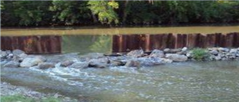
The Henry Ford Estate Dam Fishway Habitat Restoration Project won an award for creating a fish passage to form a natural channel around the dam for fish passage and improved wildlife diversity.