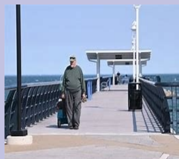
The Blossom Health Activity Pier on Lake St. Clair in St. Clair Shores once had been once unkempt and uninviting, but is now a recreation destination. It offers much to the community with a 360° view of the lake.