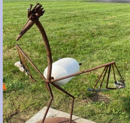
The Macomb Cultural and Economic Partnership in Mt Clemens is a winner of the Michigan Award. It hosts outdoor sculptures created by Midwest artists.