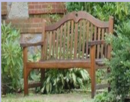
The McKinley Barrier-Free Bench Respite project in Fraser was the work of Wynn Chan and volunteers took on the task of clean-up, building flower beds and planting along the walking trail in the park.

Urban Seed was awarded for its work using a vacant lot in Eastpointe to grow healthy fruits and vegetables that they donate to the community. They are nonprofit and have developed areas for native plant restoration, wildlife habitats, and